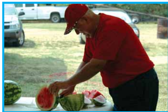
Thirty ice-cold watermelons went fast!

Then it was time to go home. Trophies won and trailers loaded, a long weekend of fun was over. See ya next Labor Day!